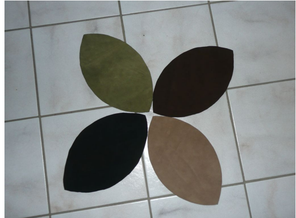
Fig.2 The leather pieces

Now you should have four identically shaped pieces of leather. As I constructed my ball, I used four different colours. This is just to give the ball a special touch.