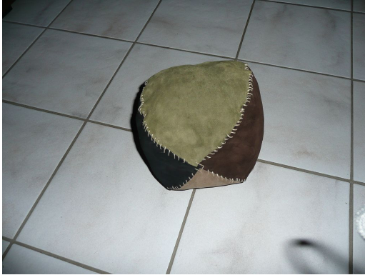
Fig.4 The finished ball

Finally the wool rests are stuffed into the ball until it is plump. Then you can sew the last part together. Now you have a simple ball ready for playing.