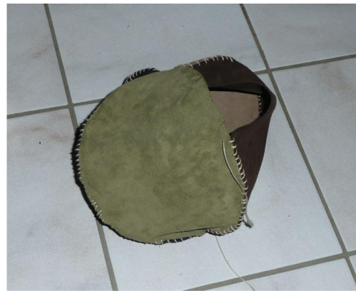
Fig.3 The open hull

Now you only have to sew the edges of the leather pieces together. You have to stop when only a small piece at one corner is left open.